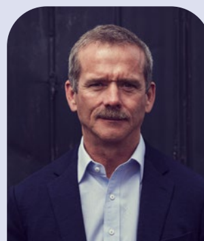
Chris Hadfield

Astronaut | First Canadian Commander of the International Space Station