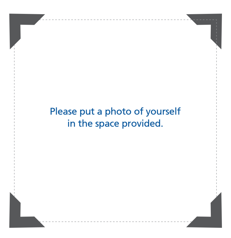
Please put a photo of yourself in the space provided.

The Alzheimer Society is the leading nationwide health charity for people living with Alzheimer's disease and other dementias. Active in communities across Canada, the Society: