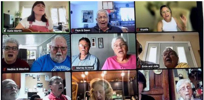
Creating harmony in our Active Living, Musical Minds virtual group.