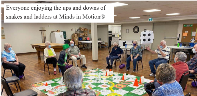
Everyone enjoying the ups and downs of snakes and ladders at Minds in Motion®

In-home Recreation provides respite for caregivers while engaging persons with dementia in social and recreational activities. This is done by identifying the person living with dementia's interests and abilities and providing the appropriate level of support from In-Home Recreation staff and volunteers.