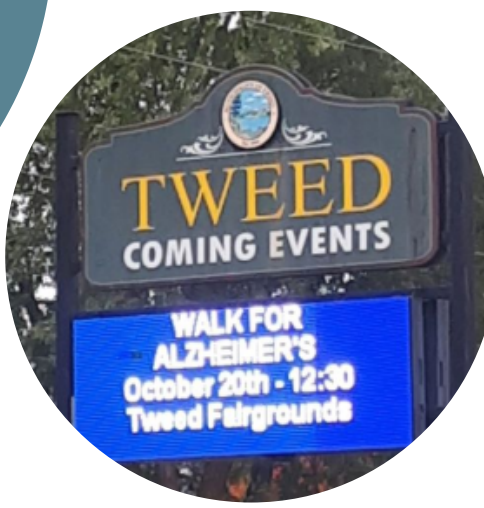
TWEED OCTOBER 20, 2019 OVER $18 000 Organized by the Kiwanis Club of Tweed