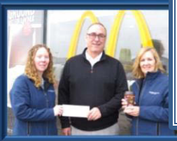
Coffee Break Fall 2019