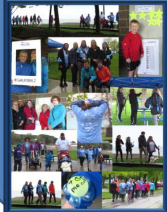
IG Wealth Management Walk for Alzheimer's May 2019 Clinton, Exeter, Goderich, Grand Bend, and Wingham