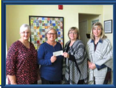
Chosen as the 2019 Charity of Choice by The Bluffs community