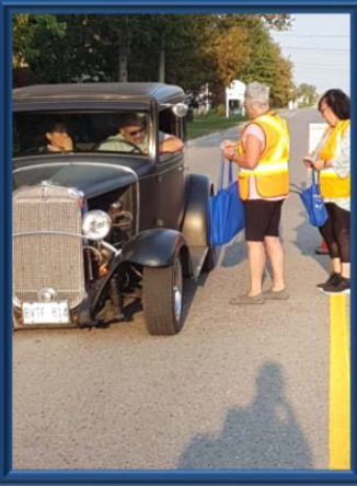
Drive for Dementia September 2019