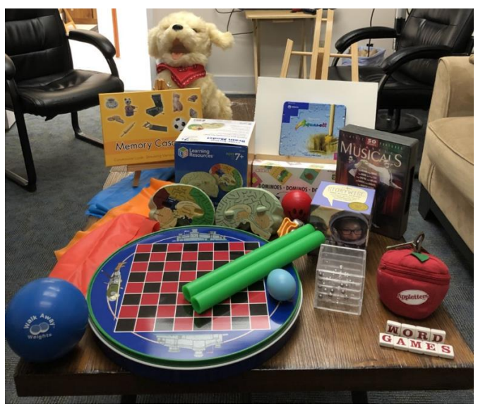
*Here is an example of an in-home activation kit that delivers a combination of physical and cognitive activities*

In-home Activation kits are designed and assembled for each individual, based upon their individual needs.