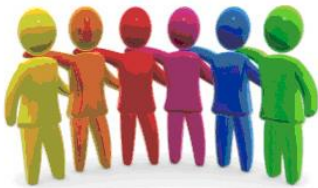
Here to help

To participate fully in the Zoom groups, you will need a computer, tablet or smart phone that has a camera and an internet connection, however if you only have a phone, you can still call into the groups. Just contact us to get the phone number for the group you would like to join. Please note that you will often be in the virtual “waiting room”; you just sit back and relax, and we’ll do the rest.