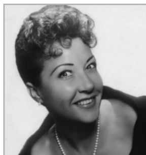
figure of Broadway's golden age. With her signature belt and unmatched vocal projection, Merman became synonymous with the brassy bold

Ethel Merman (1908–1984) was a legendary American actress and singer whose booming voice and powerful stage presence made her a defining