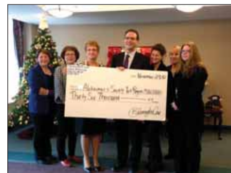
Bloomington Cove's annual Walk for Memories raised $36,000 for the Alzheimer Society of York Region in 2012, significantly exceeding the $6,000 raised in each of the previous two years.