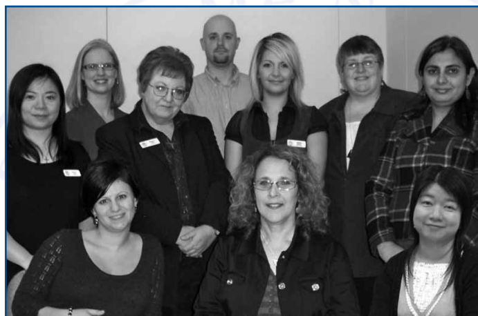
Caregiver Support and Education Team