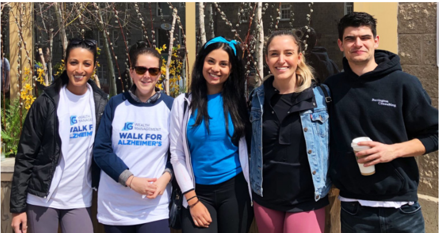
Barrington Consulting Team at the 2019 IG Wealth Management Walk for Alzheimer’s